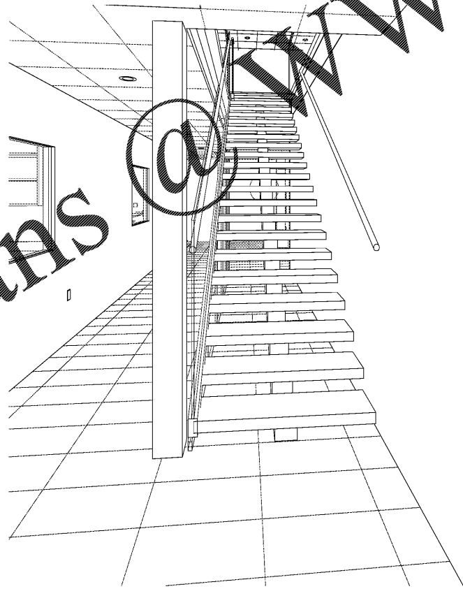
2 1ST FLOOR GOING UP STAIRS ID-5.2