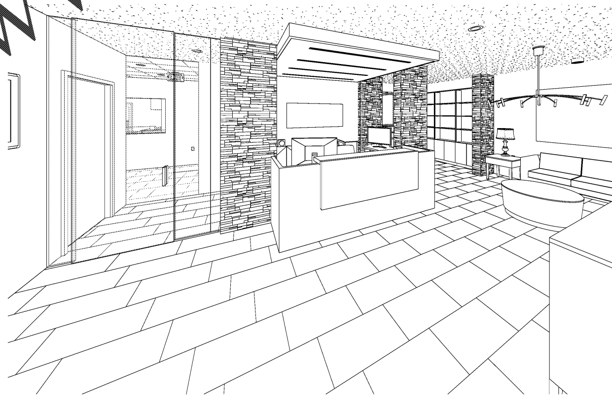
1 FRONT DESK @ ENTRANCE 2 ID-5.1