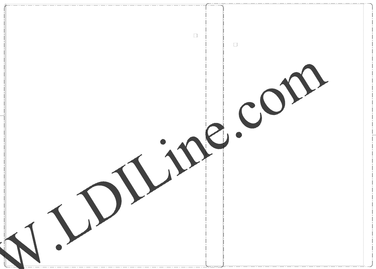
3 ROOF MECHANICAL PLAN - OVERALL 1" = 20'-0"