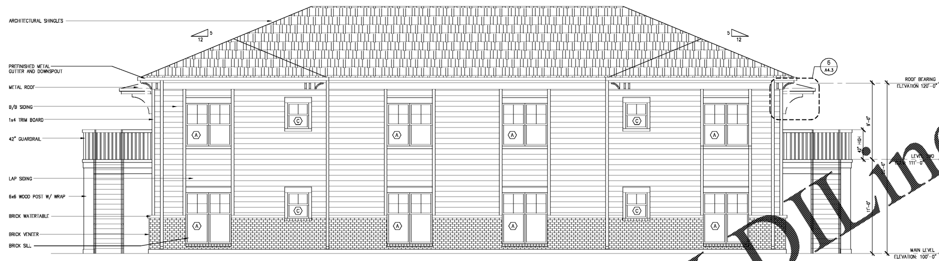
2 ELEVATION: REAR SCALE: 1/4"=1'-0"

ELEVATION NOTES: 1. SEE A7.1 FOR WINDOW SCHEDULE 2. SEE FINISH NOTES FOR EXTERIOR COLOR SCHEDULE 3. FIELD VERIFY FINAL WALK GRADE AT EXI STAIR 4. PROVIDE ONE WINDOW PER SLEEPING UNIT W 5.7 SF EGRESS AREA 5. PAINT ALL WALL & ROOF PENETRATIONS TO MATCH ADJACENT SURFACE 6. SEE LANDSCAPE DWGS FOR MECH UNIT SCREENING