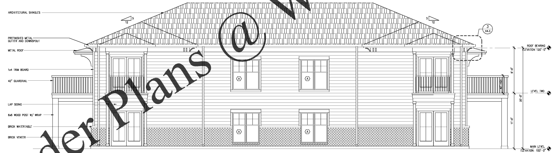
1 ELEVATION: FRONT SCALE: 1/4"=1'-0"

ELEVATION NOTES: 1. SEE A7.1 FOR WINDOW SCHEDULE 2. SEE FINISH NOTES FOR EXTERIOR COLOR SCHEDULE 3. FIELD VERIFY FINAL WALK GRADE AT EXI STAIR 4. PROVIDE ONE WINDOW PER SLEEPING UNIT W 5.7 SF EGRESS AREA 5. PAINT ALL WALL & ROOF PENETRATIONS TO MATCH ADJACENT SURFACE 6. SEE LANDSCAPE DWGS FOR MECH UNIT SCREENING