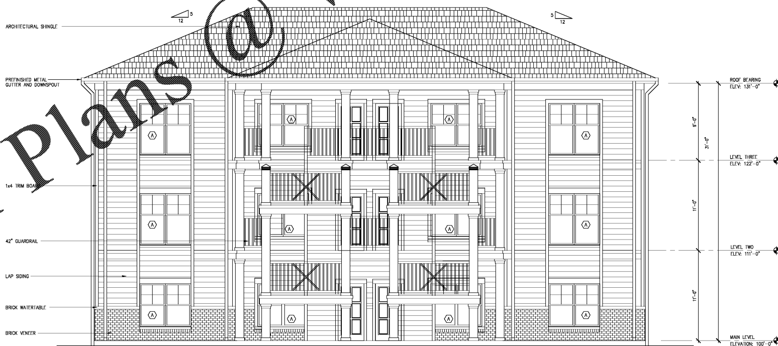
1 ELEVATION: Front SCALE: 1/4"=1'-0"