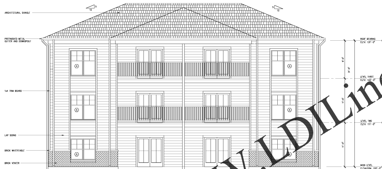
2 ELEVATION: Rear SCALE: 1/4"=1'-0"