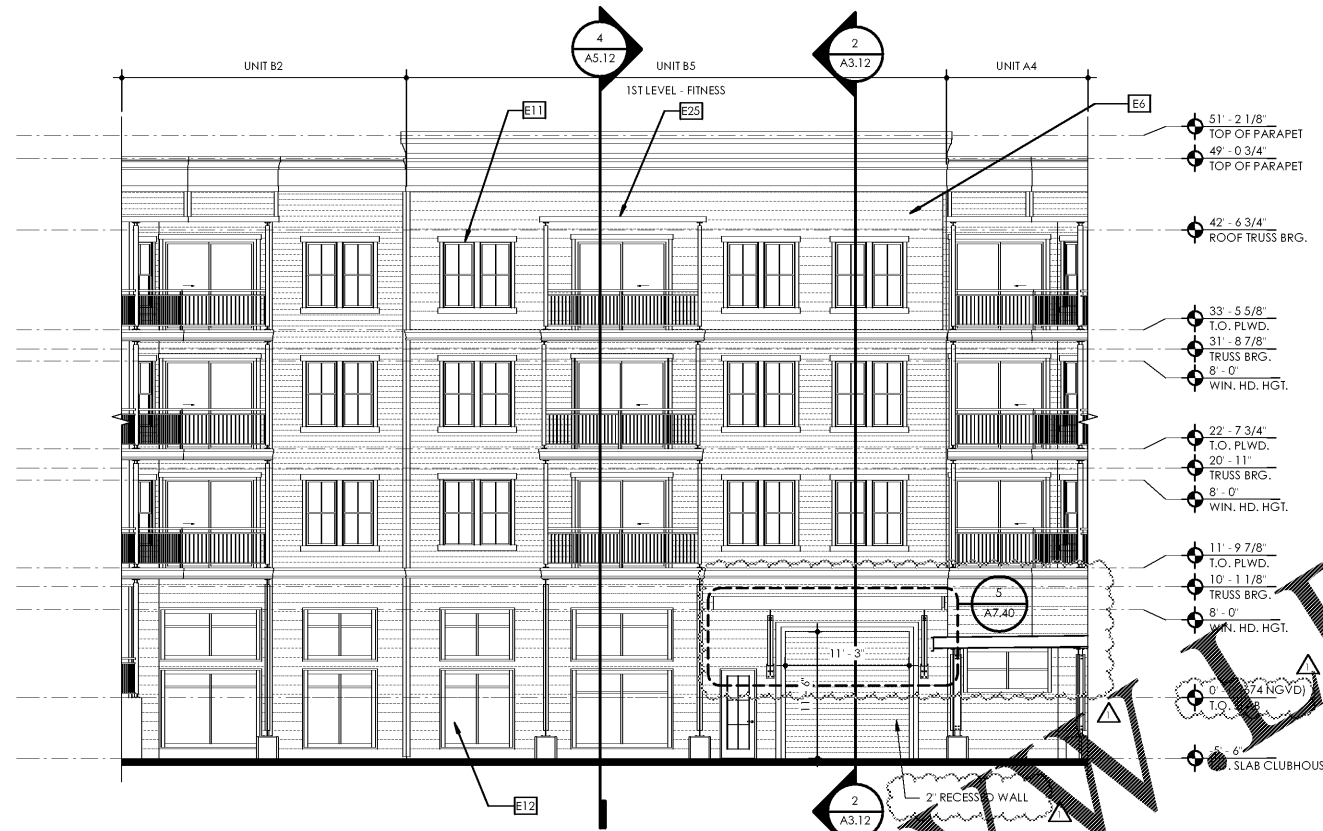
② POOL COURTYARD - WEST SIDE G