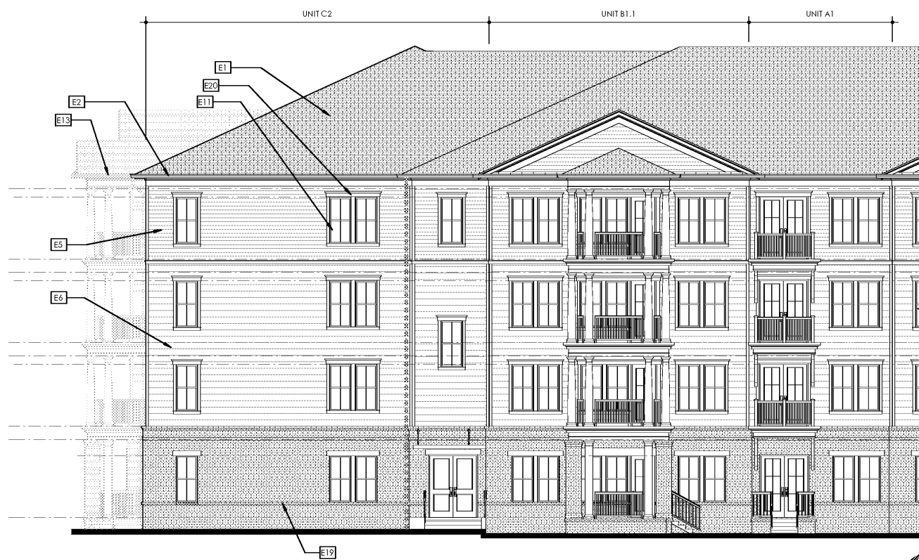
2 BUILDING ELEVATION - EAST SIDE D