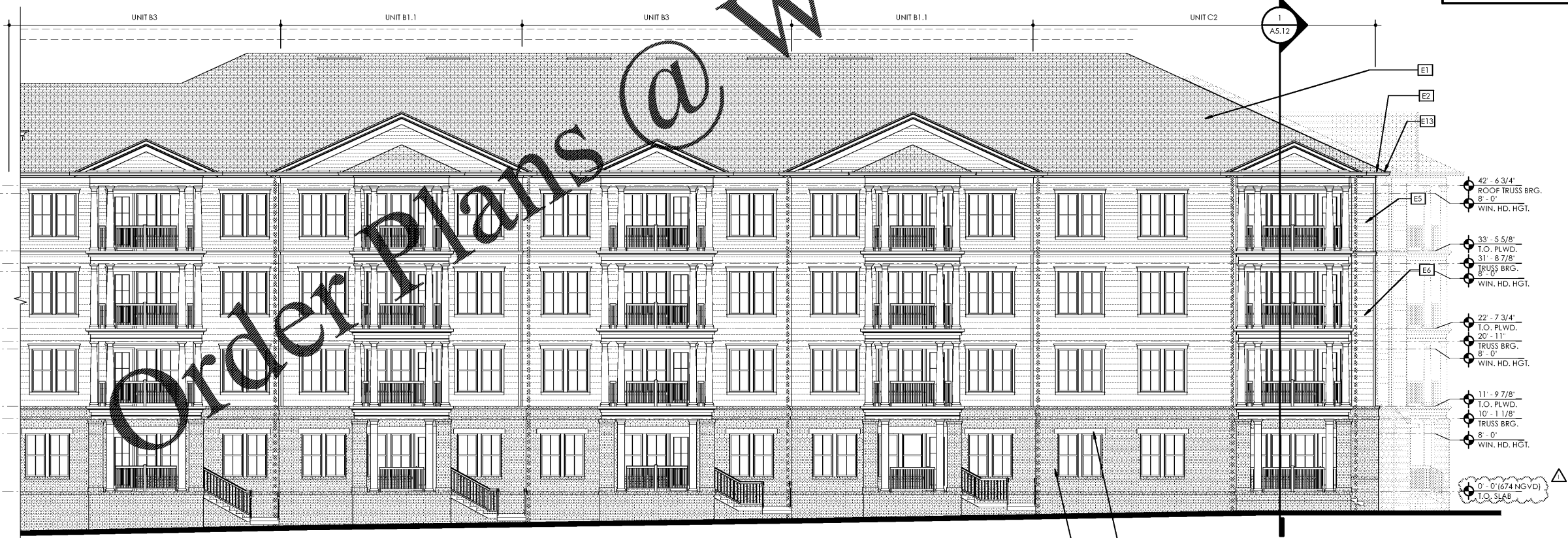
1 BUILDING ELEVATION - SOUTH SIDE D