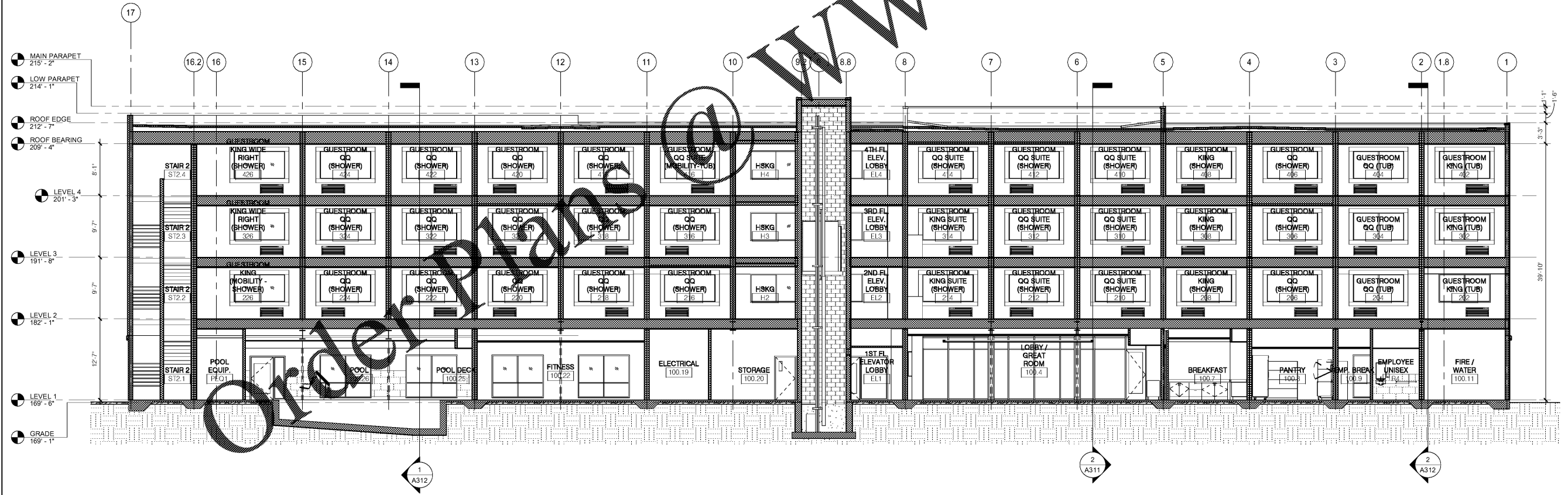
1 BLDG SECTION 3 1/8" = 1'-0"