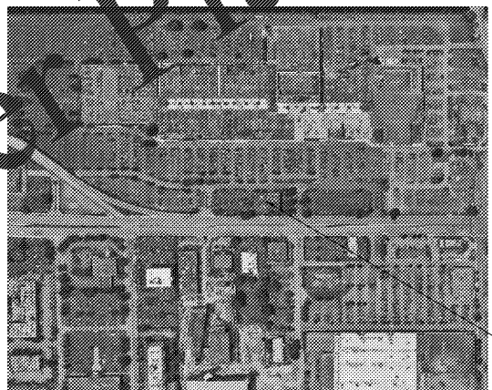
2 SITE MAP G001 6" = 1'-0"