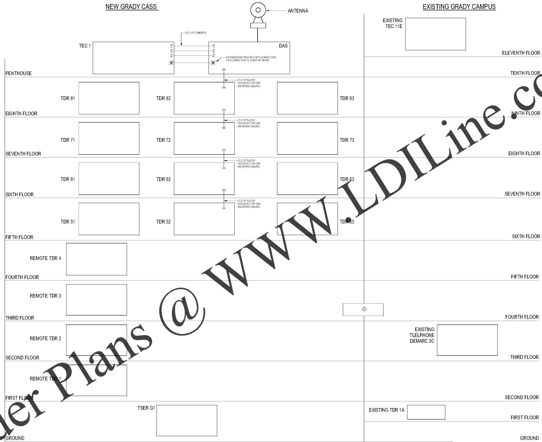
1 TELECOMMUNICATIONS DAS RISER DIAGRAM 1/2" = 1'-0"