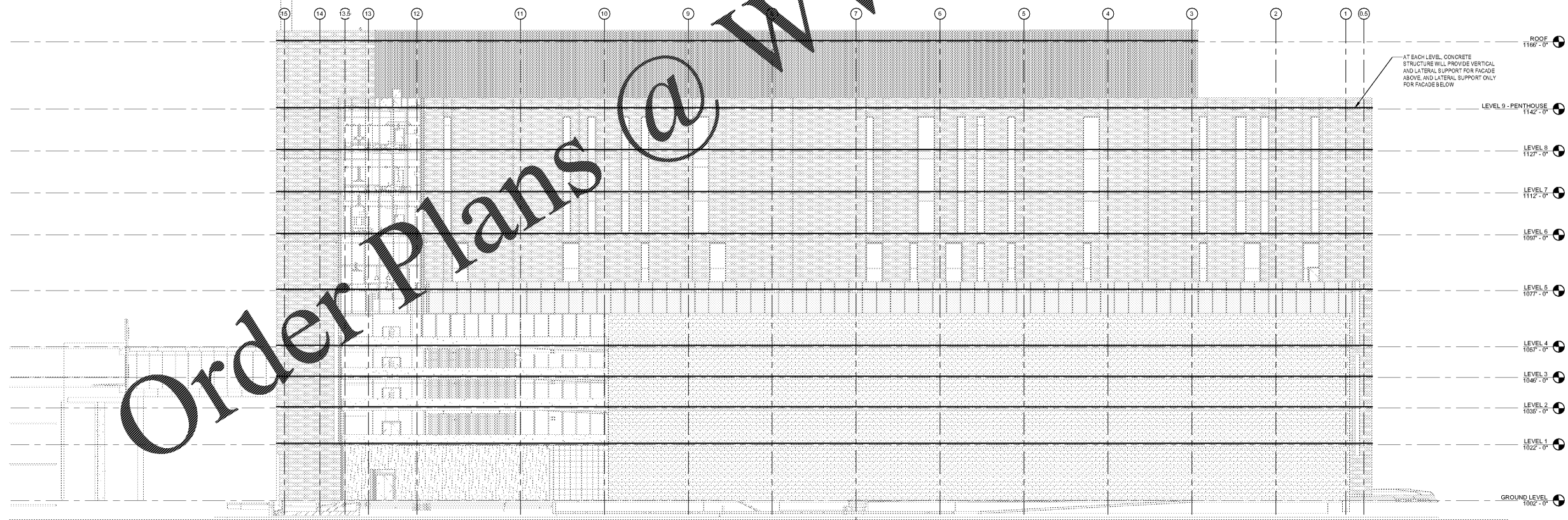
2 NORTH ELEVATION 1/16" = 1'-0"