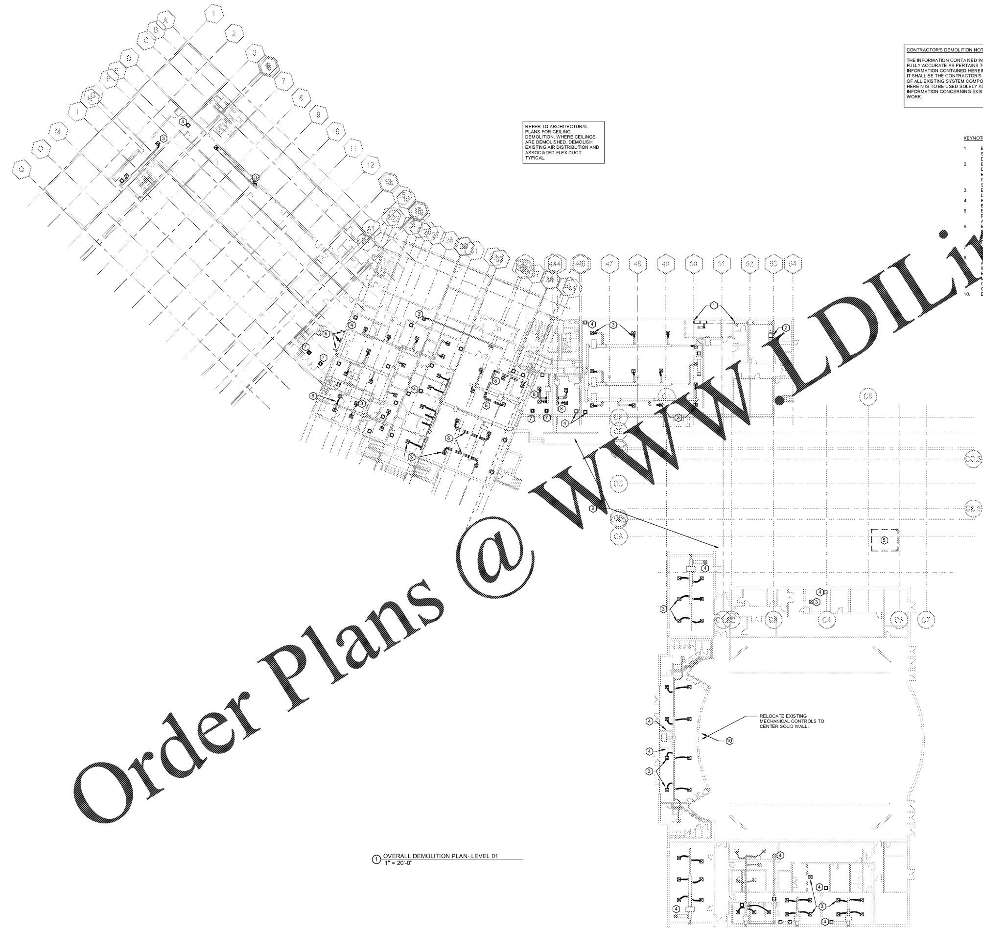
1 OVERALL DEMOLITION PLAN - LEVEL 01 1" = 20'-0"