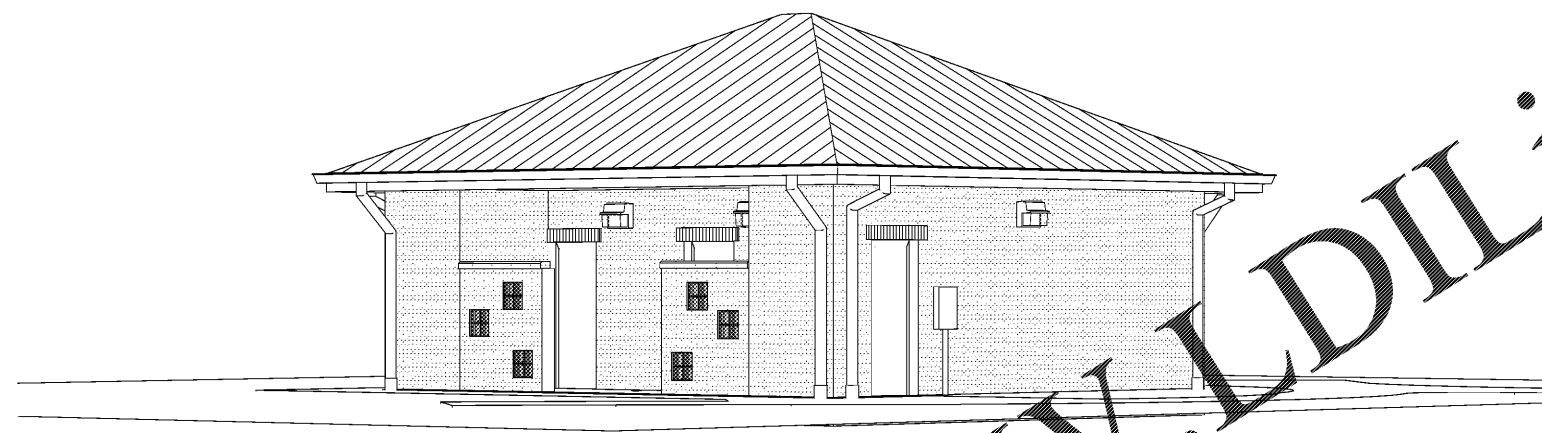
H7 A-901 EXTERIOR PERSPECTIVE - FRONT, RIGHT SIDE