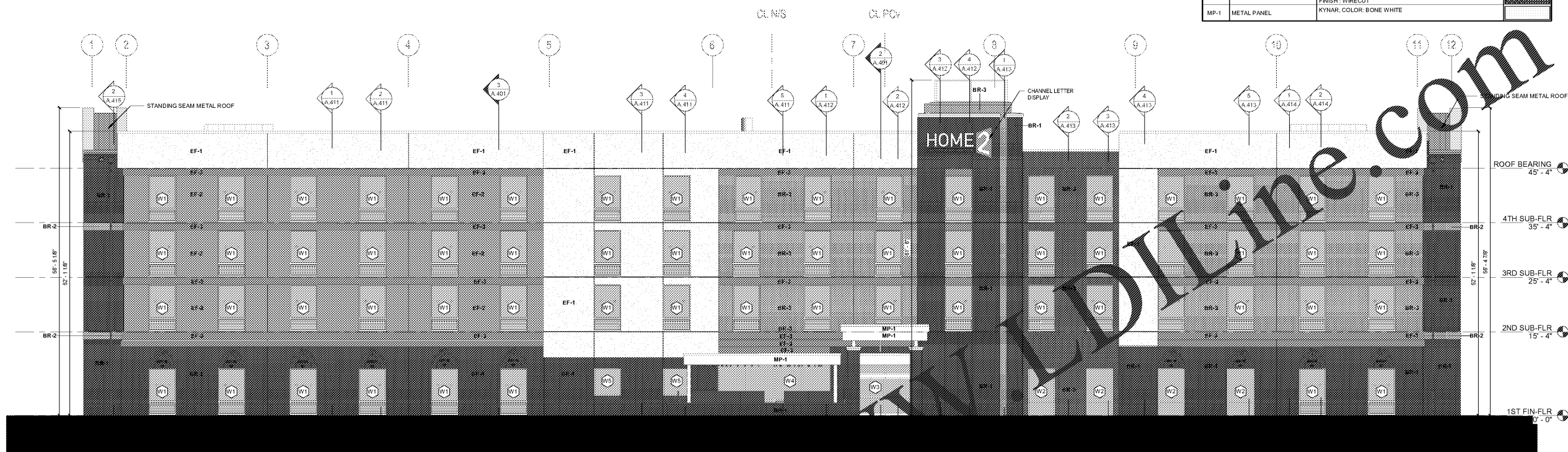
1 SOUTH ELEVATION SCALE: 1/8" = 1'-0"