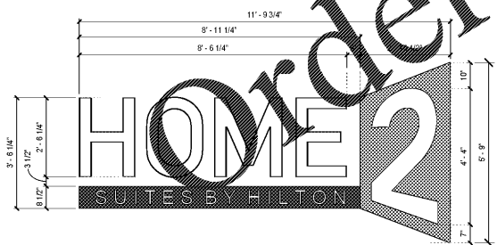
CHANNEL LETTER DISPLAY