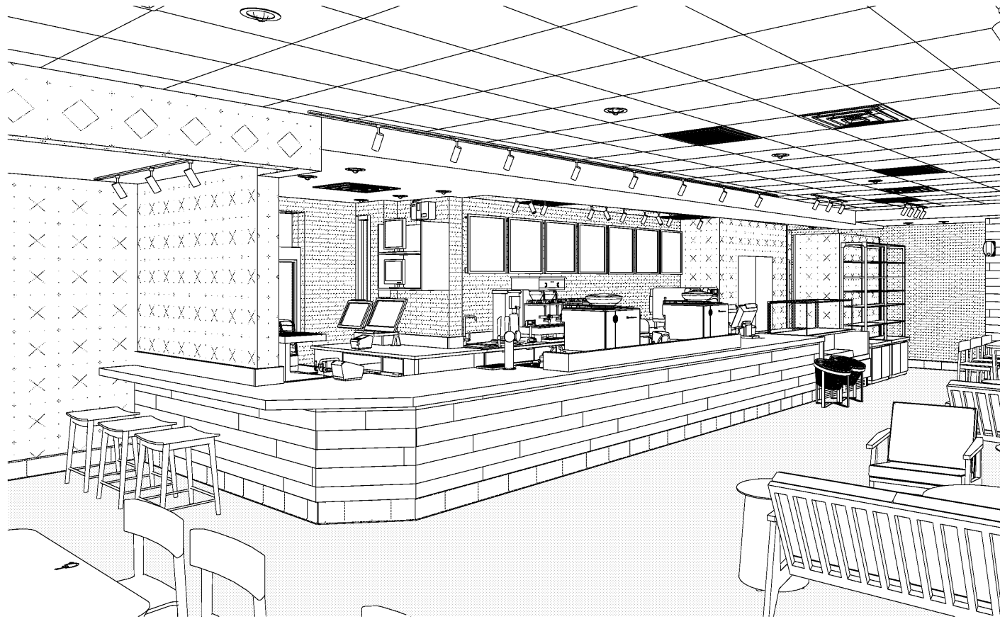
1 3D VIEW - FRONTBAR Scale: