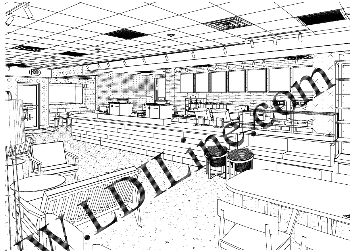
2 3D VIEW - CAFE Scale: