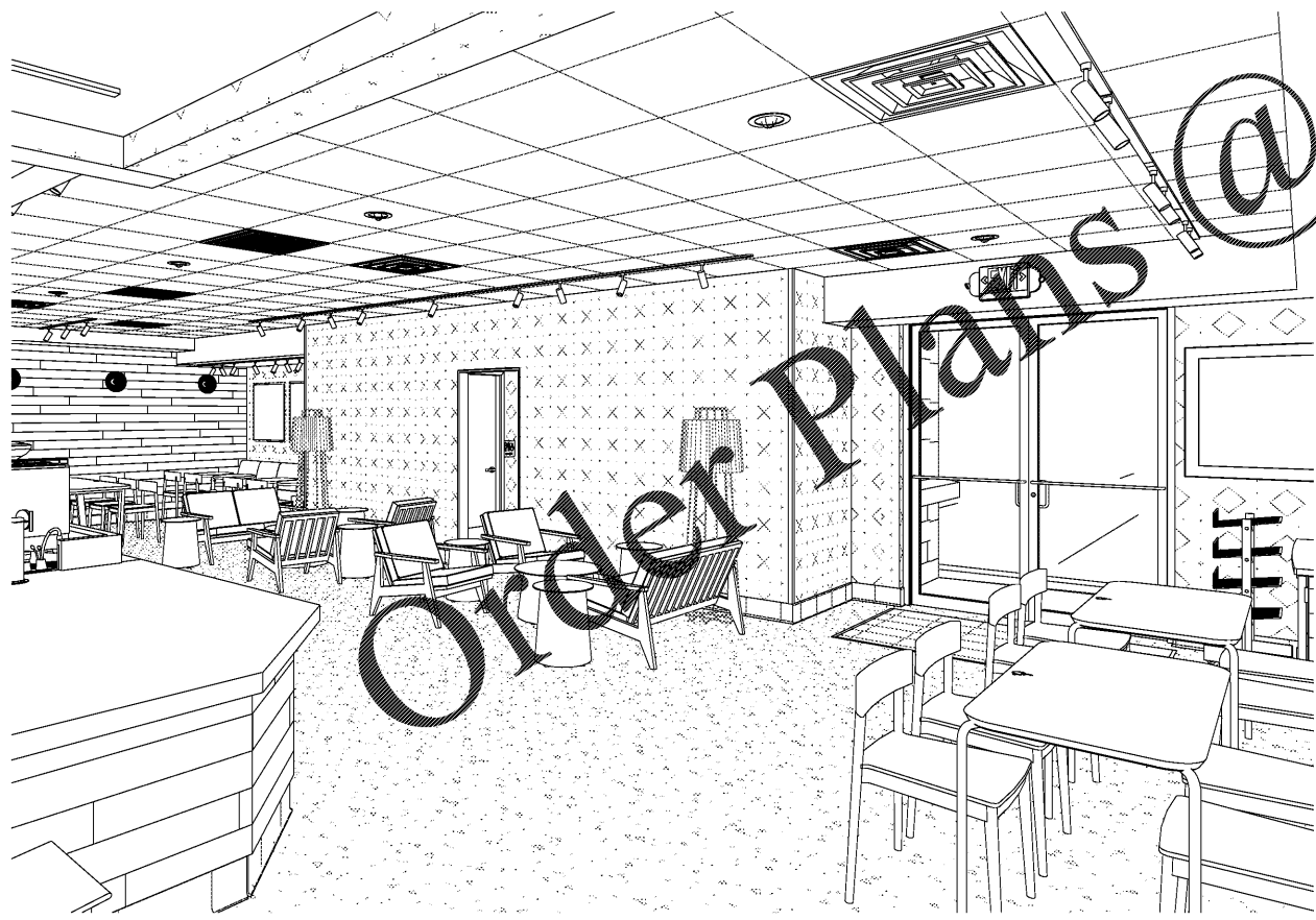
3 3D VIEW - SEATING Scale: