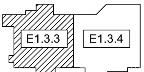
01 PARTIAL REFRIGERATION ELECTRICAL POWER PLAN WEST SCALE: 3/32" = 1'-0"