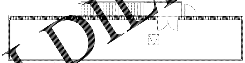
1 DIMENSIONED PLAN SCALE: 1/8" = 1'-0"

DIMENSION NOTES - EXTERIOR DIMENSIONS ARE FROM FACE OF STUD/ EDGE OF SLAB TO FACE OF METAL STUD/ EDGE OF SLAB. - EXTERIOR DIMENSIONS ARE FROM FACE OF CMU WALL TO EDGE OF CMU WALL. INTERIOR DIMENSIONS ARE FROM FACE OF CMU WALL TO EDGE OF CMU WALL. INTERIOR DIMENSIONS ARE FROM FACE OF STUD/ EDGE OF SLAB TO FACE OF CMU WALL.