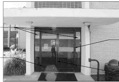
2 DOOR A2 A2.0A NOT TO SCALE