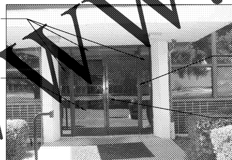
4 DOOR A4 A2.0A NOT TO SCALE