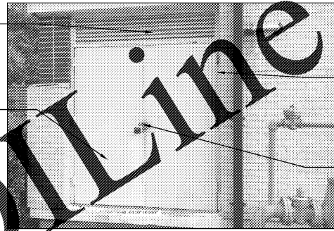
5 DOOR A5 A2.0A NOT TO SCALE

REMOVE EXISTING TRANSOM AND SIDE PANELS TYPICAL