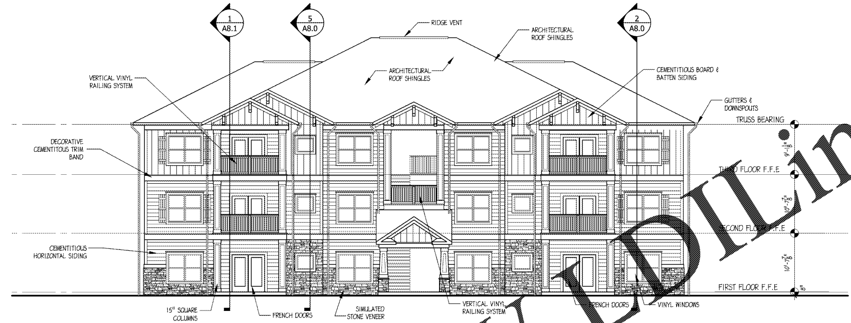
BUILDING 4 & 7 - FRONT ELEVATION A5.3 SCALE: 1/8" = 1'-0" OPPOSITE SIDE SIMILAR

ENGLISH & ASSOCIATES ARCHITECTS, INC. 3084 MERCER UNIVERSITY DRIVE, SUITE 100 ATLANTA, GEORGIA 30341 DENGGLISH@ENGLISHASSOCIATESINC.COM