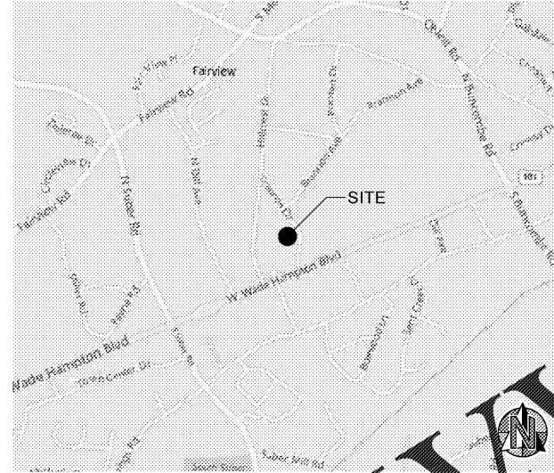
VICINITY MAP 1"=1,000'