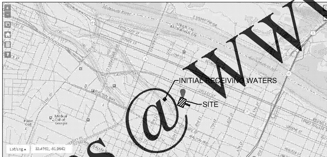
SURFACE DRAINAGE AREA MAP