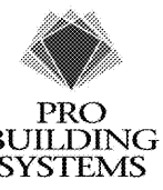
PRO BUILDING SYSTEMS DESIGN BUILD CONTRACTORS