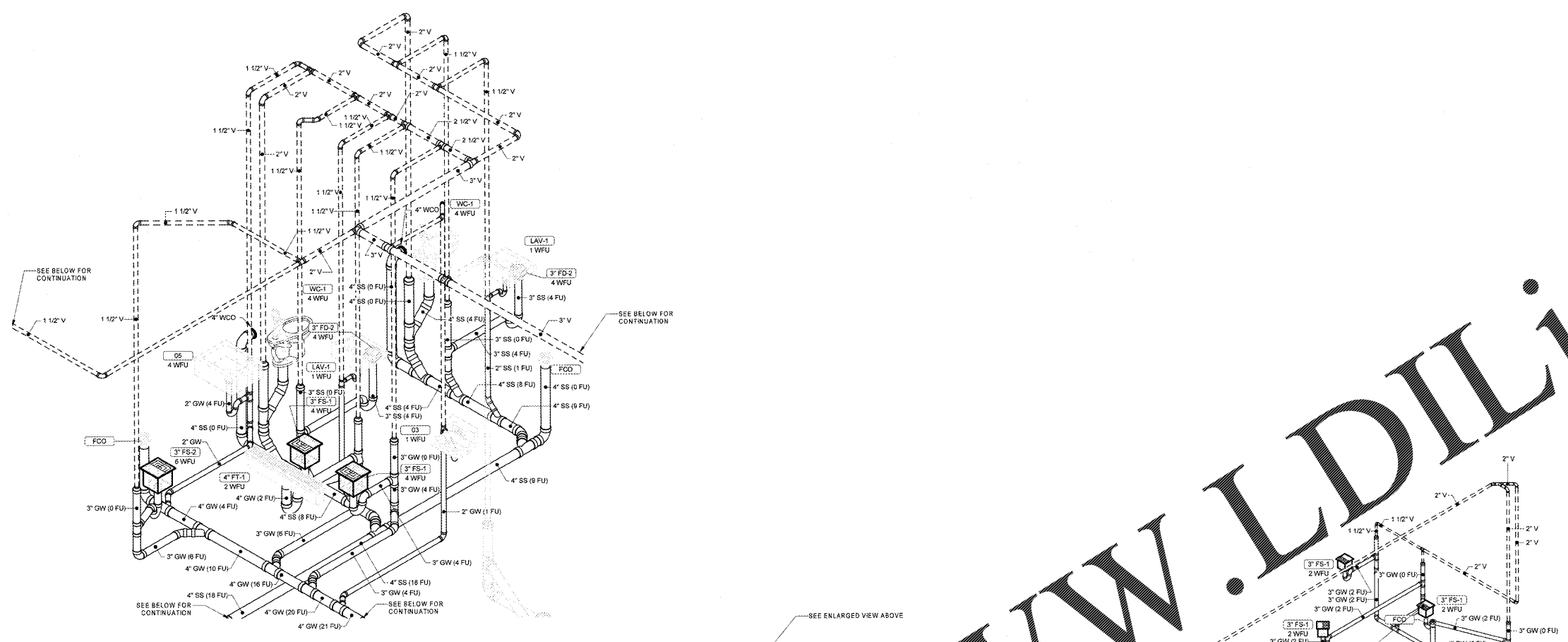
2 waste and vent stack diagram - enlarged SCALE | N.T.S.