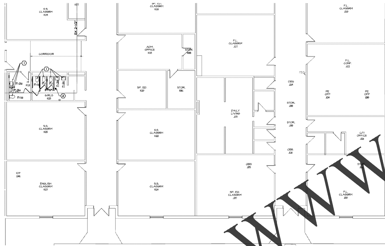
UPPER LEVEL FLOOR PLAN - PLUMBING P-3.17 1/8"=1'-0"

SEE SHEET P-3.11 FOR GENERAL AND REFERENCE NOTES