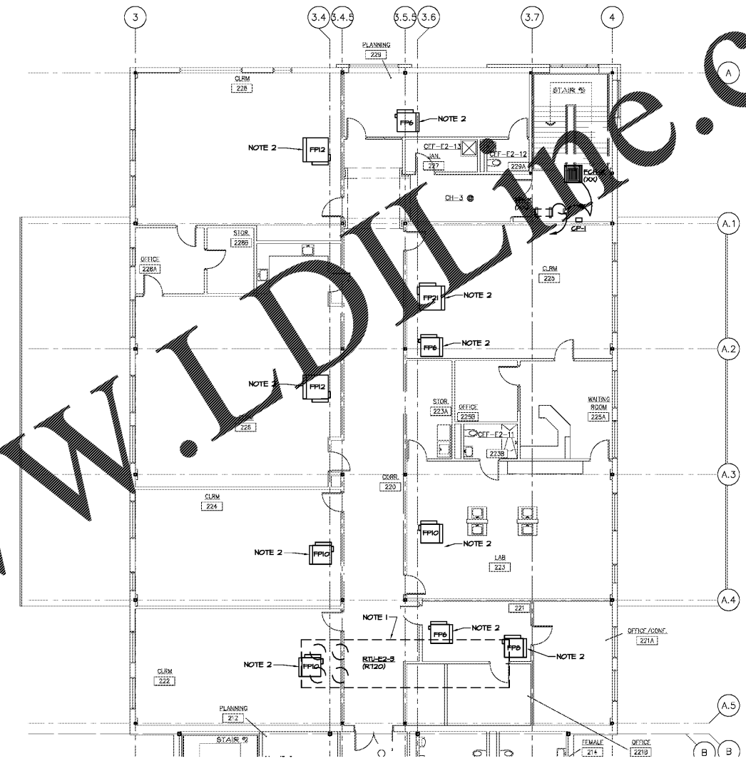
2 PARTIAL FLOOR PLAN - BLDG E - SECOND FLOOR - WING 2 - ELECTRICAL E1.9 1/8"=1'-0"