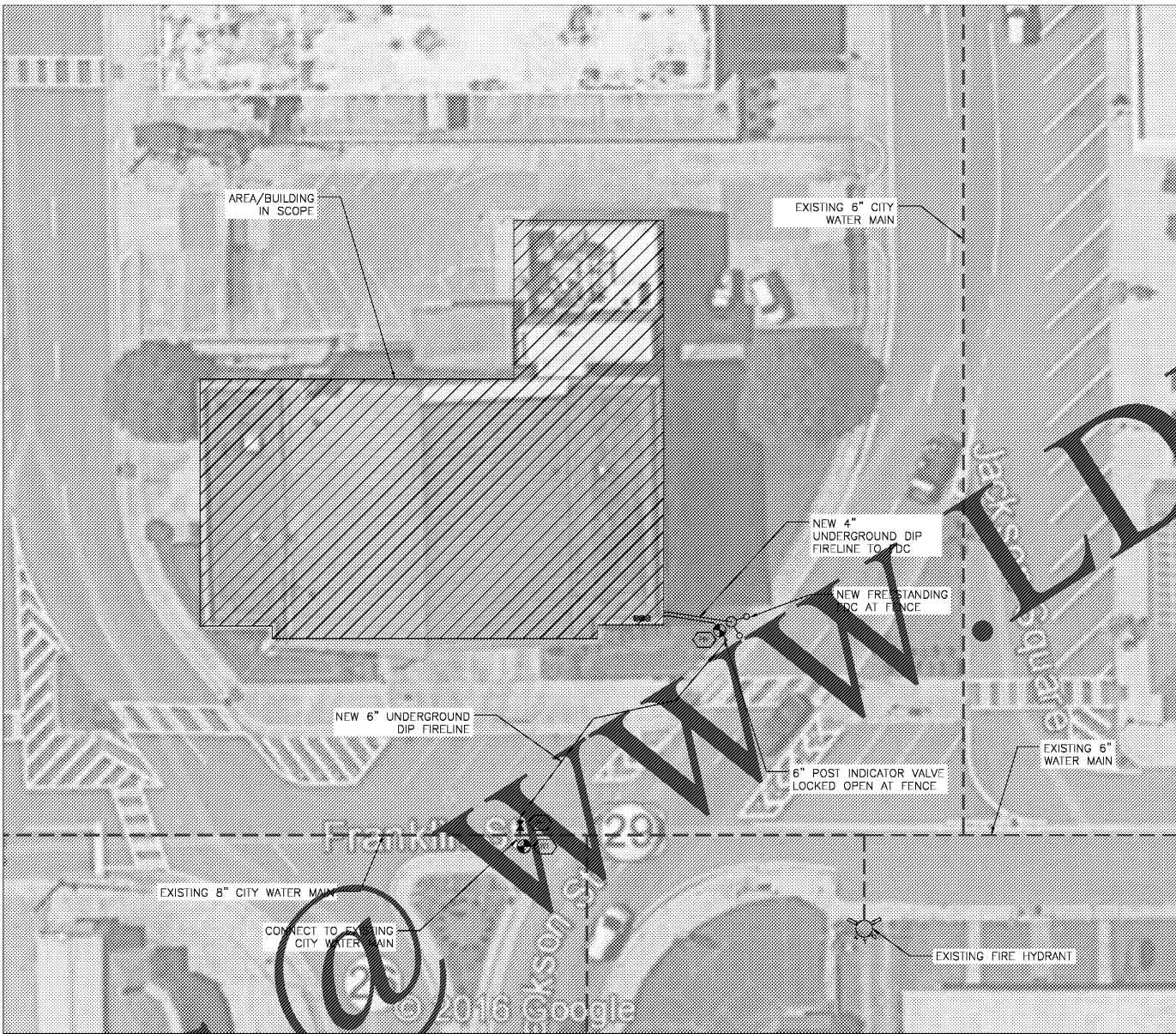
FIRE SPRINKLER SITE PLAN

AKEA INC. 3603 NW 98th Street, STE B Gainesville, FL 32606 Phone: (352) 474-6124 COA: FL #26693