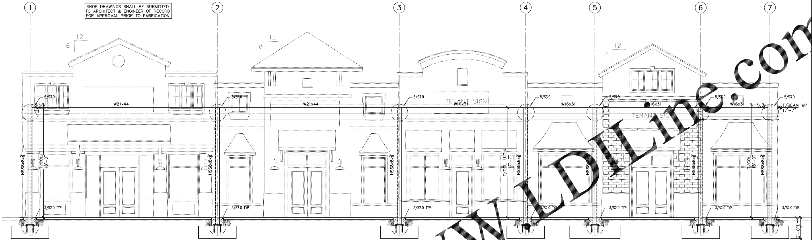
1 BUILDING 2 FRONT SCHEMATIC STEEL FRAMING ELEVATIONS (COLUMN LINE A) S4.01 SCALE: 1/4" = 1'-0"

SHOP DRAWINGS SHALL BE SUBMITTED TO ARCHITECT & ENGINEER OF RECORD FOR APPROVAL PRIOR TO FABRICATION