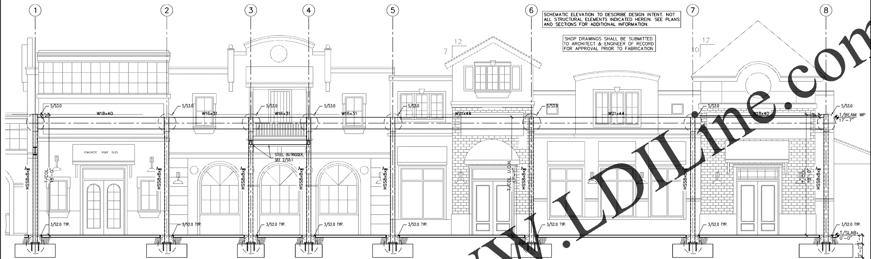
1 BUILDING 1 FRONT SCHEMATIC STEEL FRAMING ELEVATION (COLUMN LINE A) S4.01 SCALE: 1/4" = 1'-0"