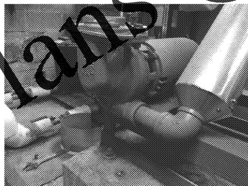
EXISTING CONDENSATE TRANSFER PUMP SCALE: NONE