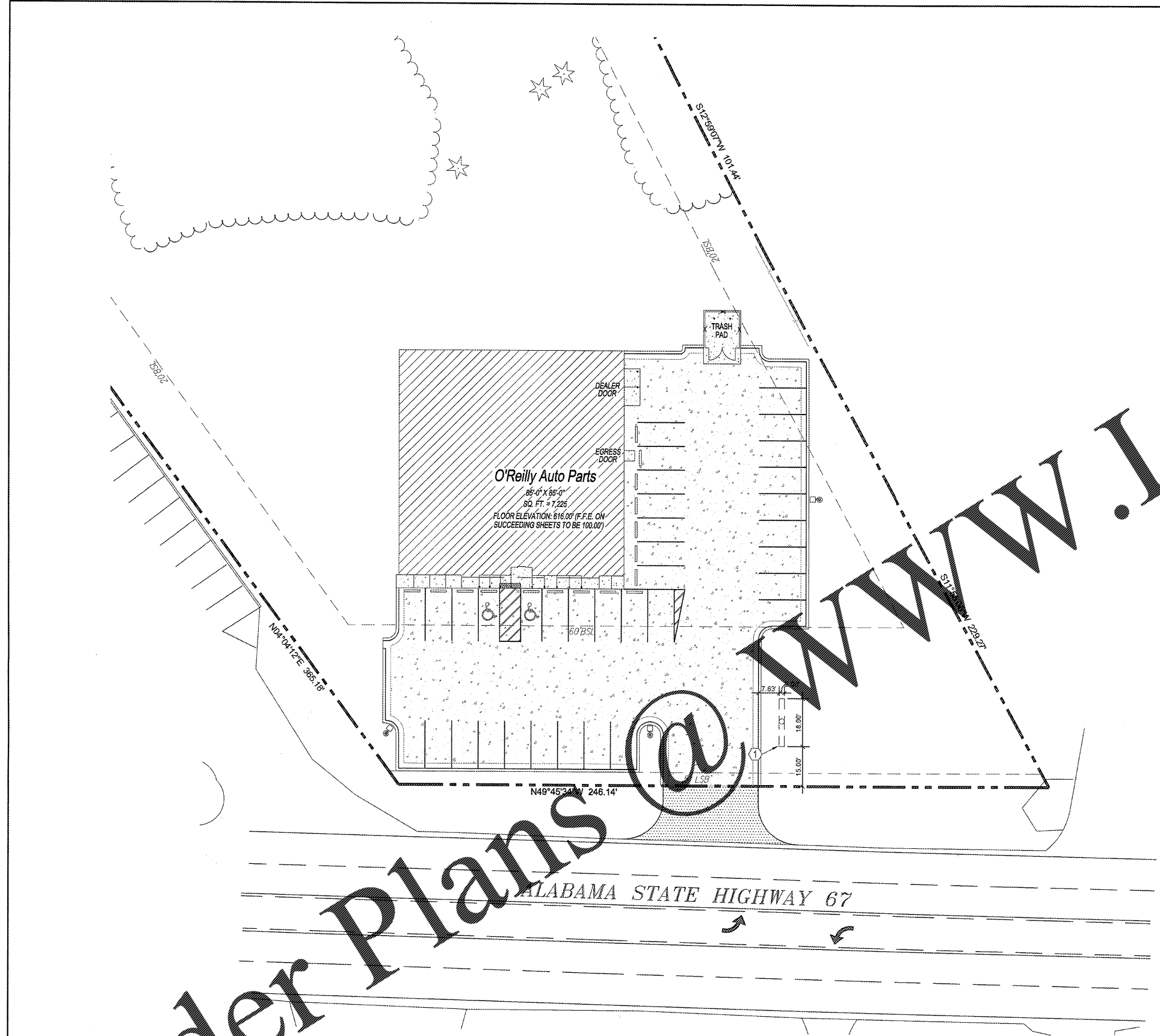
SITE SIGNAGE PLAN C2.1 SCALE: 1/8" = 1'-0"