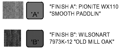
TABLE TOP FINISHES