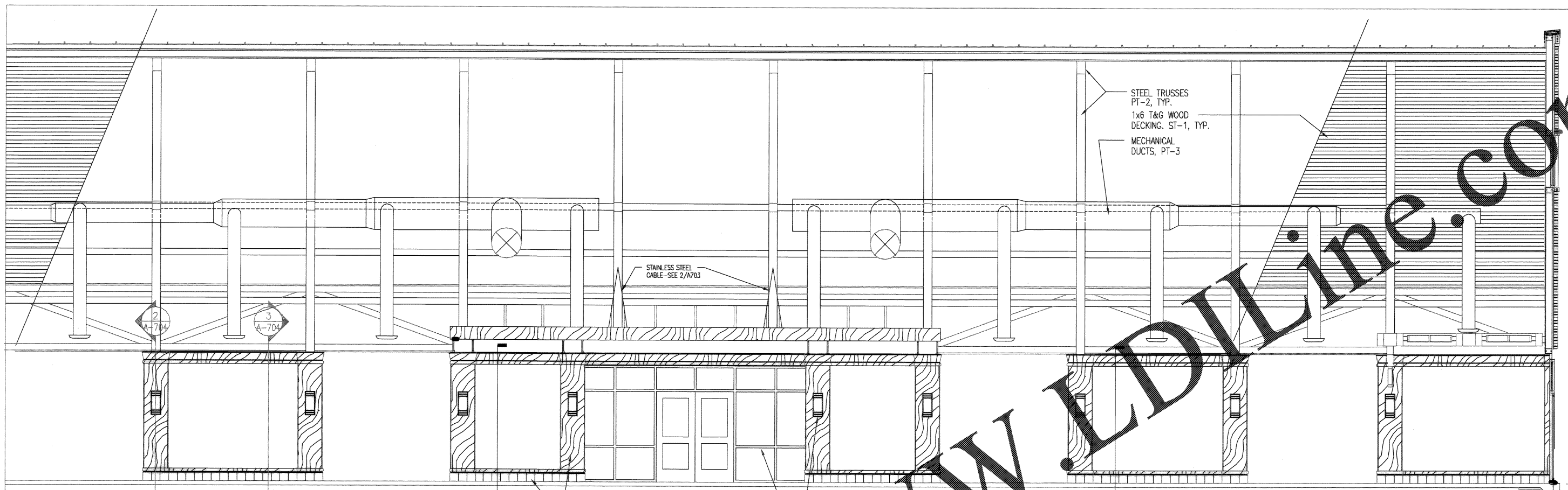
1 A102 INTERIOR ELEVATION SCALE: 1/4" = 1'-0"