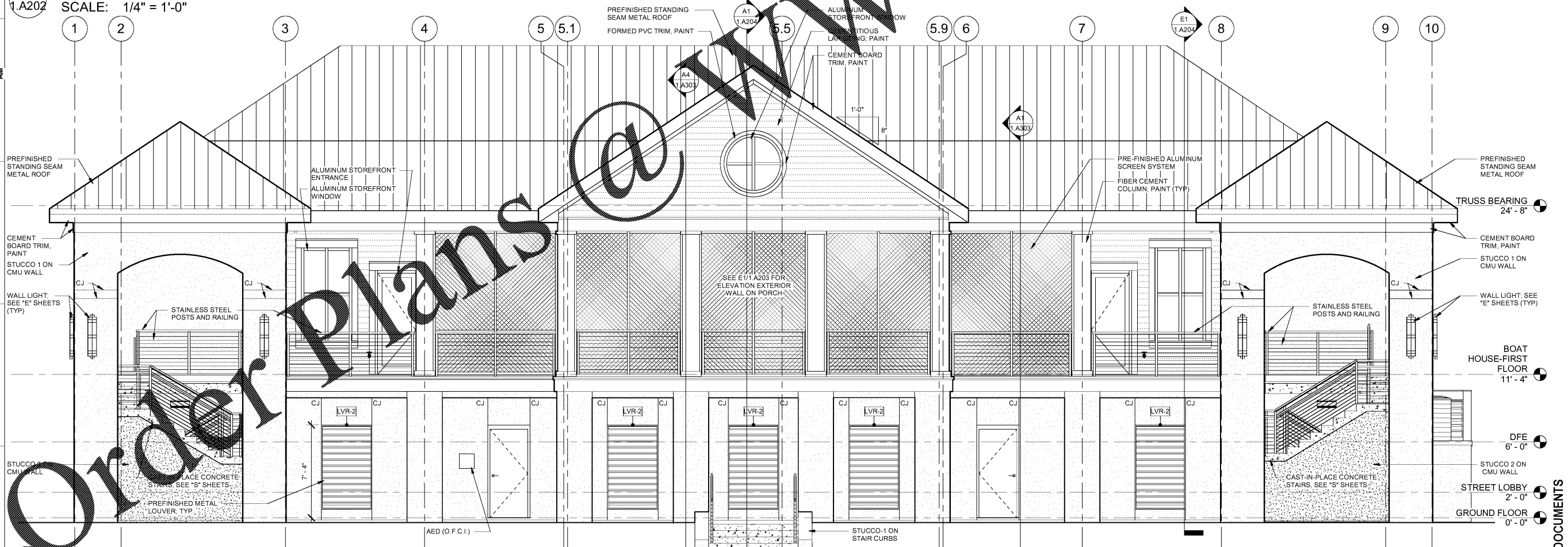
A1 1.A202 WEST ELEVATION SCALE: 1/4" = 1'-0"