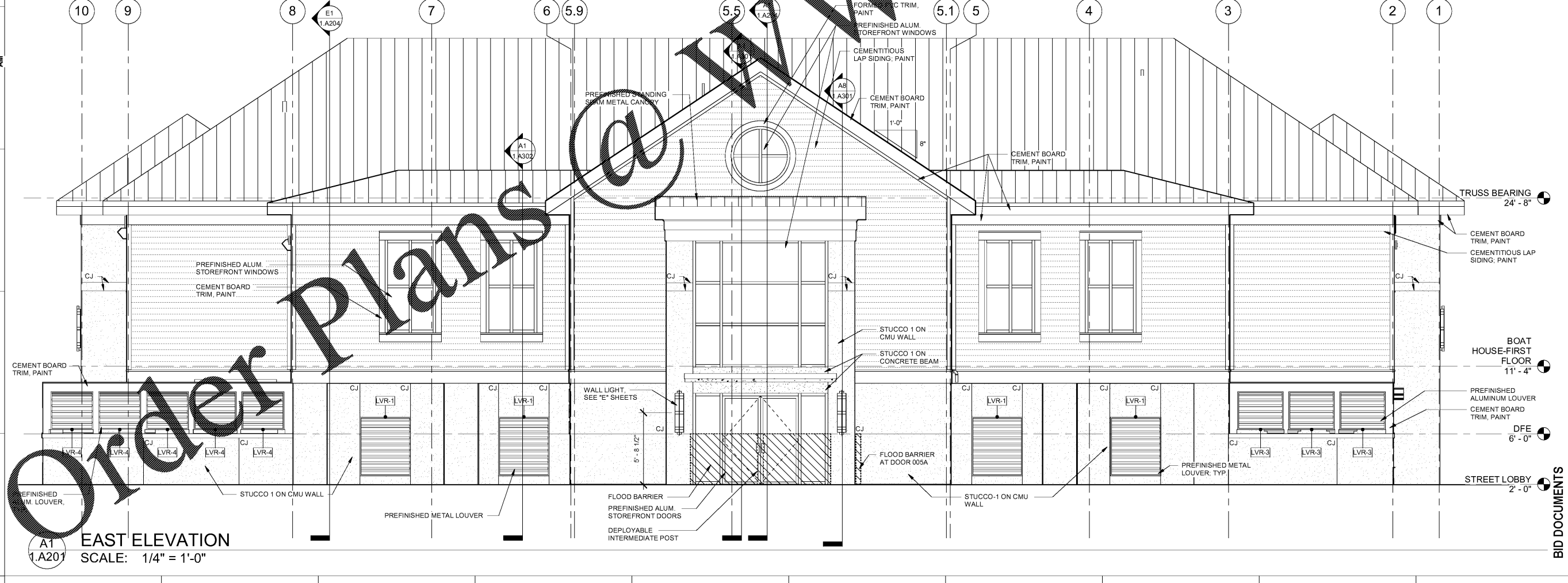
A1 EAST ELEVATION SCALE: 1/4" = 1'-0"