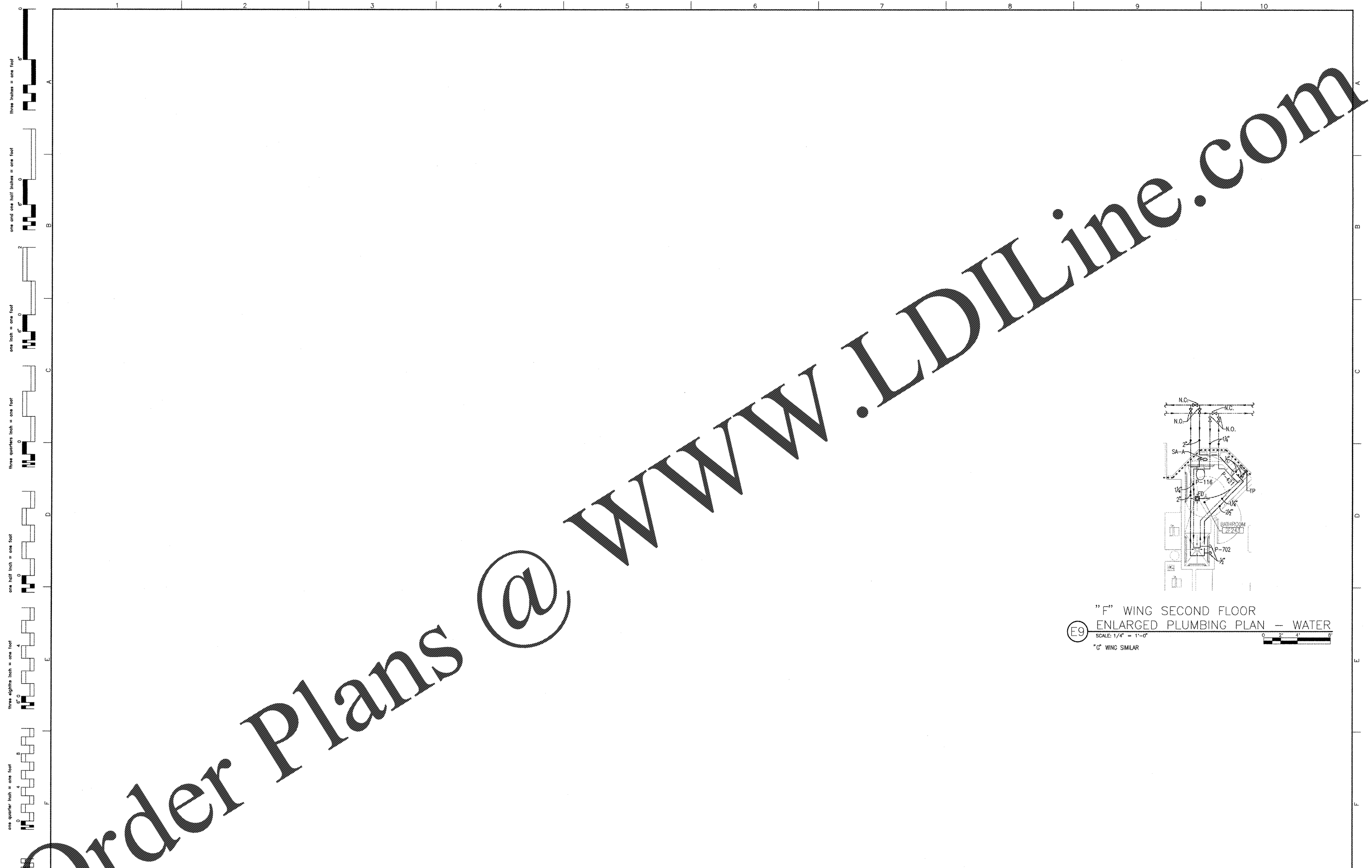
(E9) "F" WING SECOND FLOOR ENLARGED PLUMBING PLAN — WATER SCALE: 1/4" = 1'-0" "G" WING SIMILAR