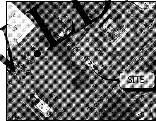
AERIAL MAP N.T.S.

THE SUBJECT PROPERTY SHOWN HEREON IS NOT LOCATED WITHIN A FLOOD HAZARD ZONE PER THE FEDERAL EMERGENCY MANAGEMENT AGENCY FLOOD INSURANCE RATE MAP OF ROCKDALE COUNTY, GEORGIA COMMUNITY PANEL NUMBER 13247C0094D, EFFECTIVE DATE OF DECEMBER 8, 2016.