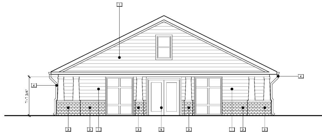
1 EXTERIOR ELEVATION scale: 1/4" = 1'-0"