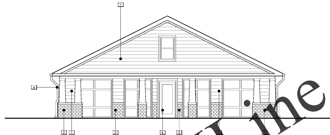
2 EXTERIOR ELEVATION scale: 1/4" = 1'-0"