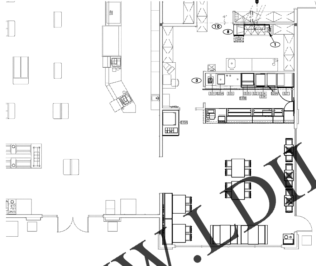
PLUMBING PLAN- WASTE RENOVATION SCALE: 3/16"=1'-0"