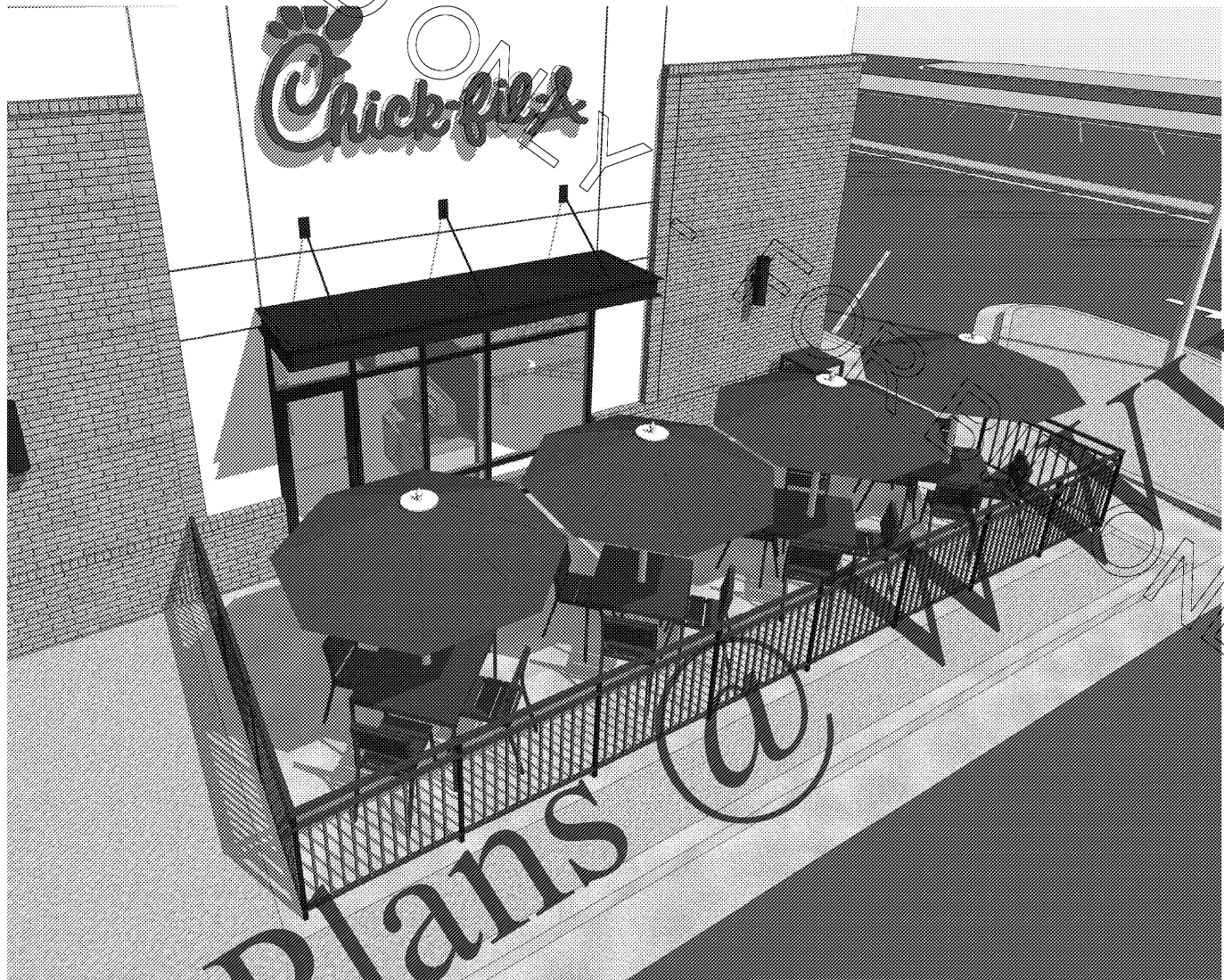
2 PERSPECTIVE VIEW - PATIO - LRG - RCP Copy 1 NTS