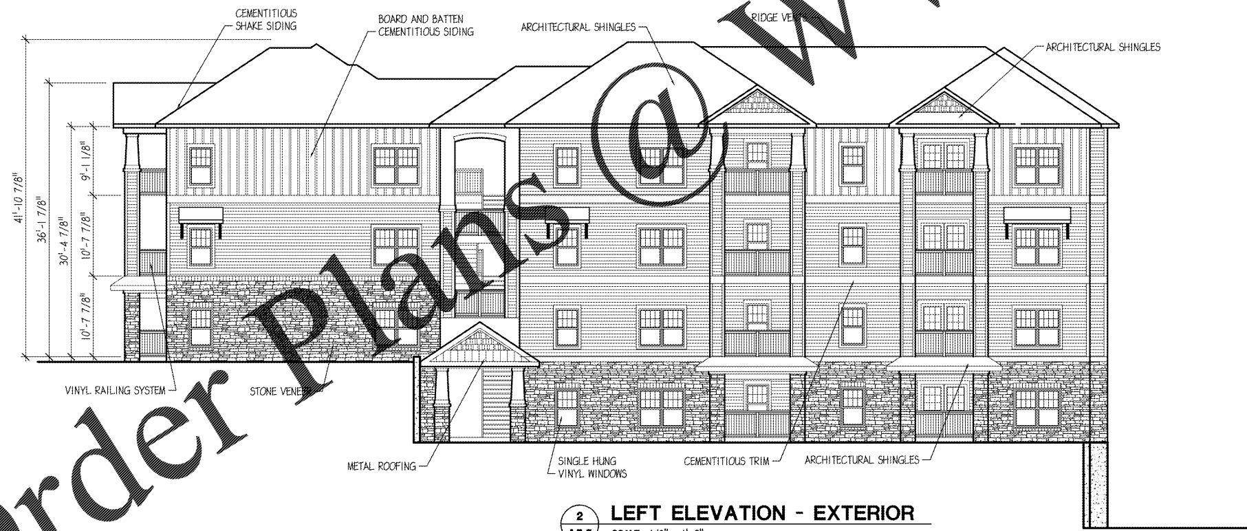
2 LEFT ELEVATION - EXTERIOR A5.5 SCALE: 1/8" = 1'-0"