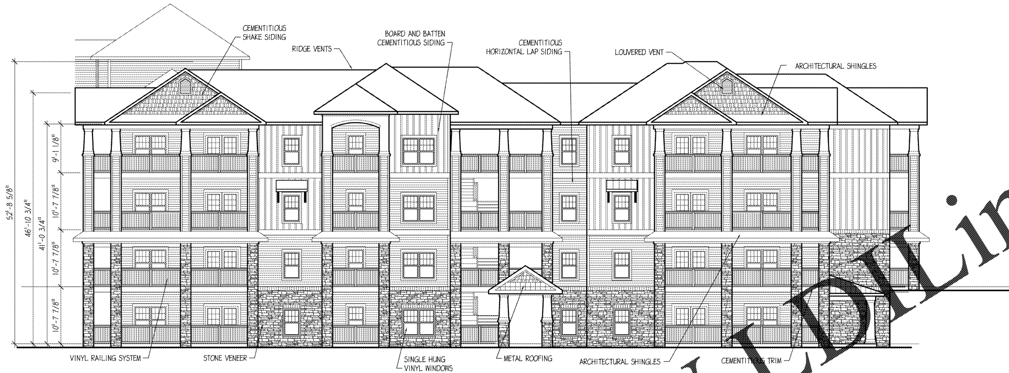
1 FRONT ELEVATION - EXTERIOR A5.5 SCALE: 1/8" = 1'-0" AT AMENITIES AREA