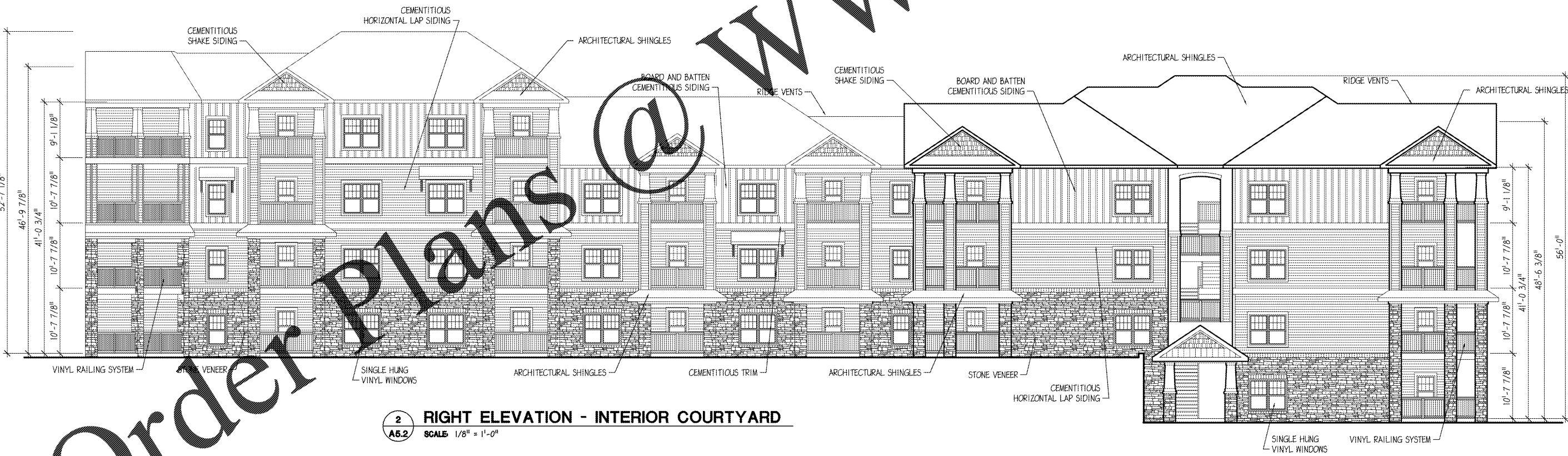
2 RIGHT ELEVATION - INTERIOR COURTYARD A5.2 SCALE 1/8" = 1'-0"