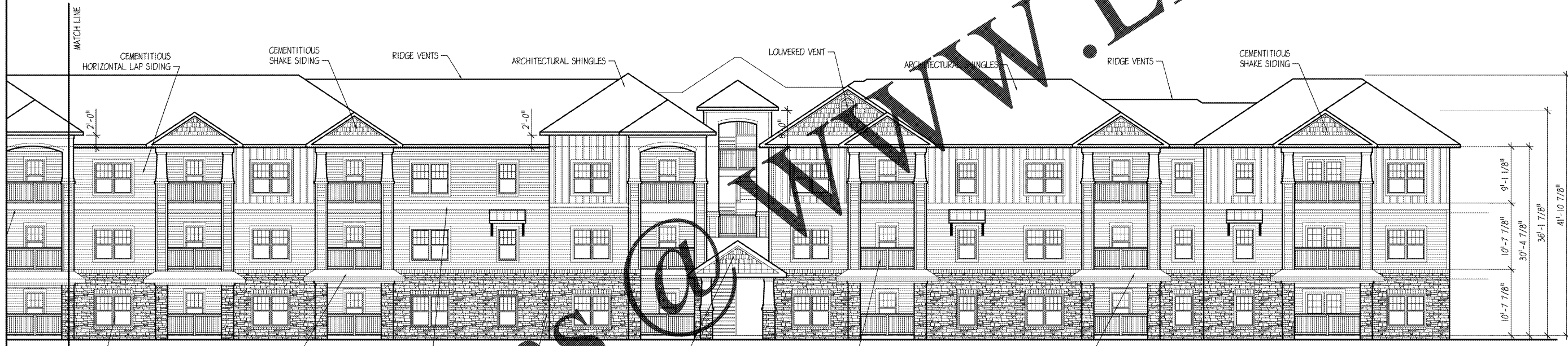
2 REAR ELEVATION - EXTERIOR SCALE: 1/8" = 1'-0"