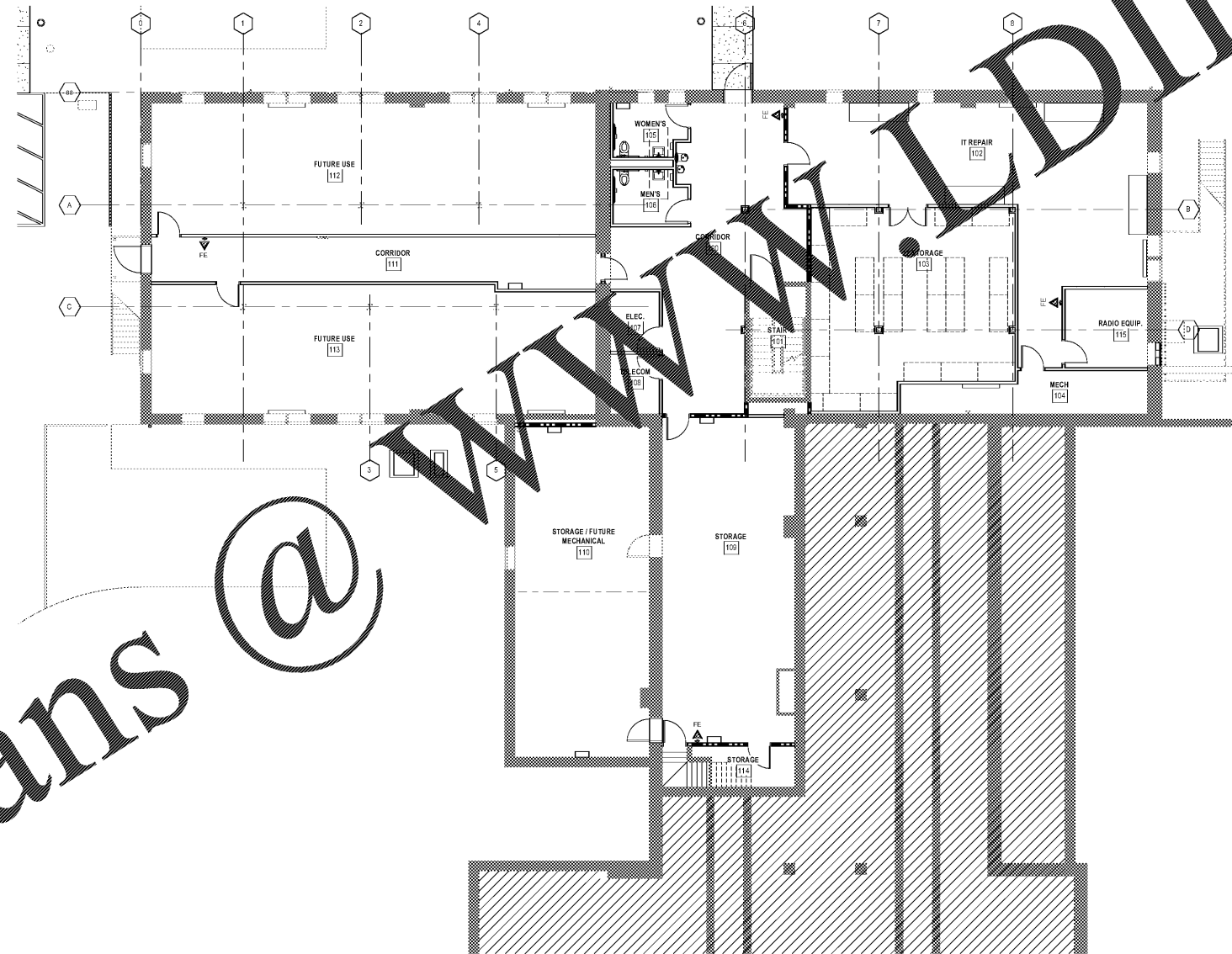
1 GROUND FLOOR FINISH PLAN 1/8" = 1'-0"