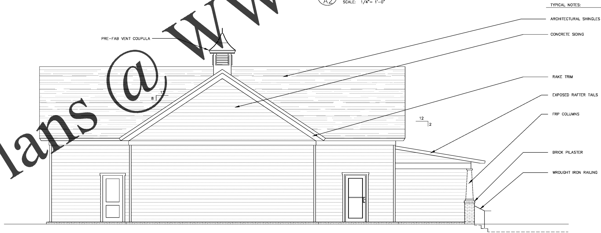
2 REAR ELEVATION A2 SCALE: 1/4" = 1'-0"