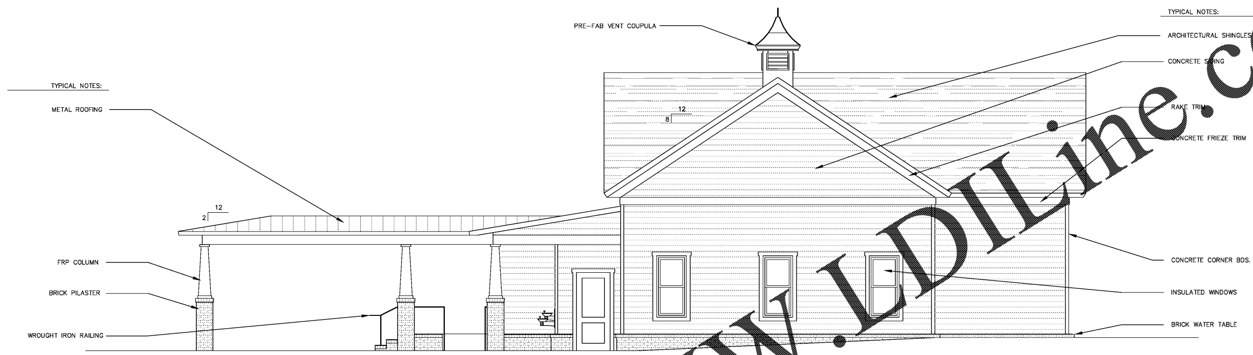
1 RIGHT SIDE ELEVATION A2 SCALE: 1/4" = 1'-0"