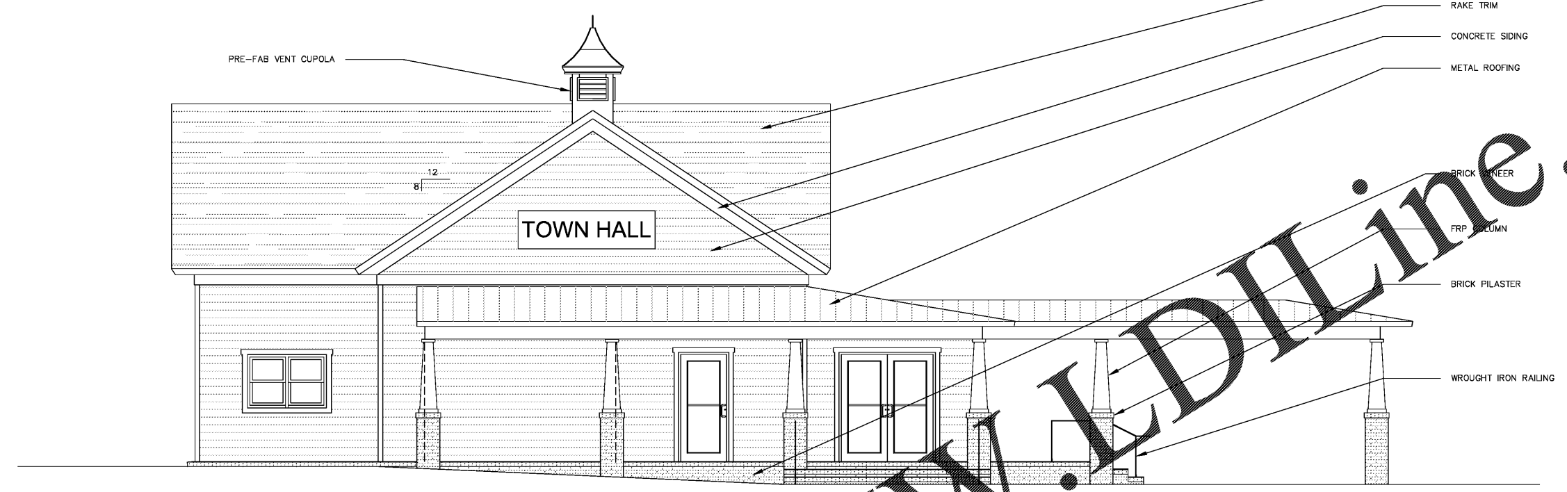
1 HILLSBORO STREET ELEVATION A1 SCALE: 1/4" = 1'-0"