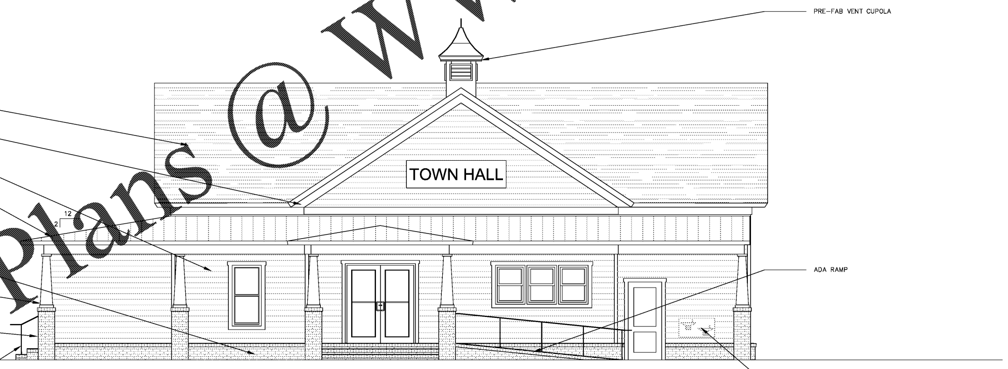
2 BALL FIELD ELEVATION A1 SCALE: 1/4" = 1'-0"