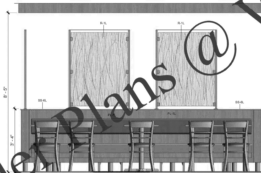
③ FW - ELEVATION 3 3/8" = 1'-0"