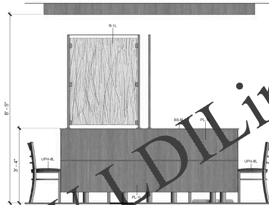
② FW - ELEVATION 2 3/8" = 1'-0"