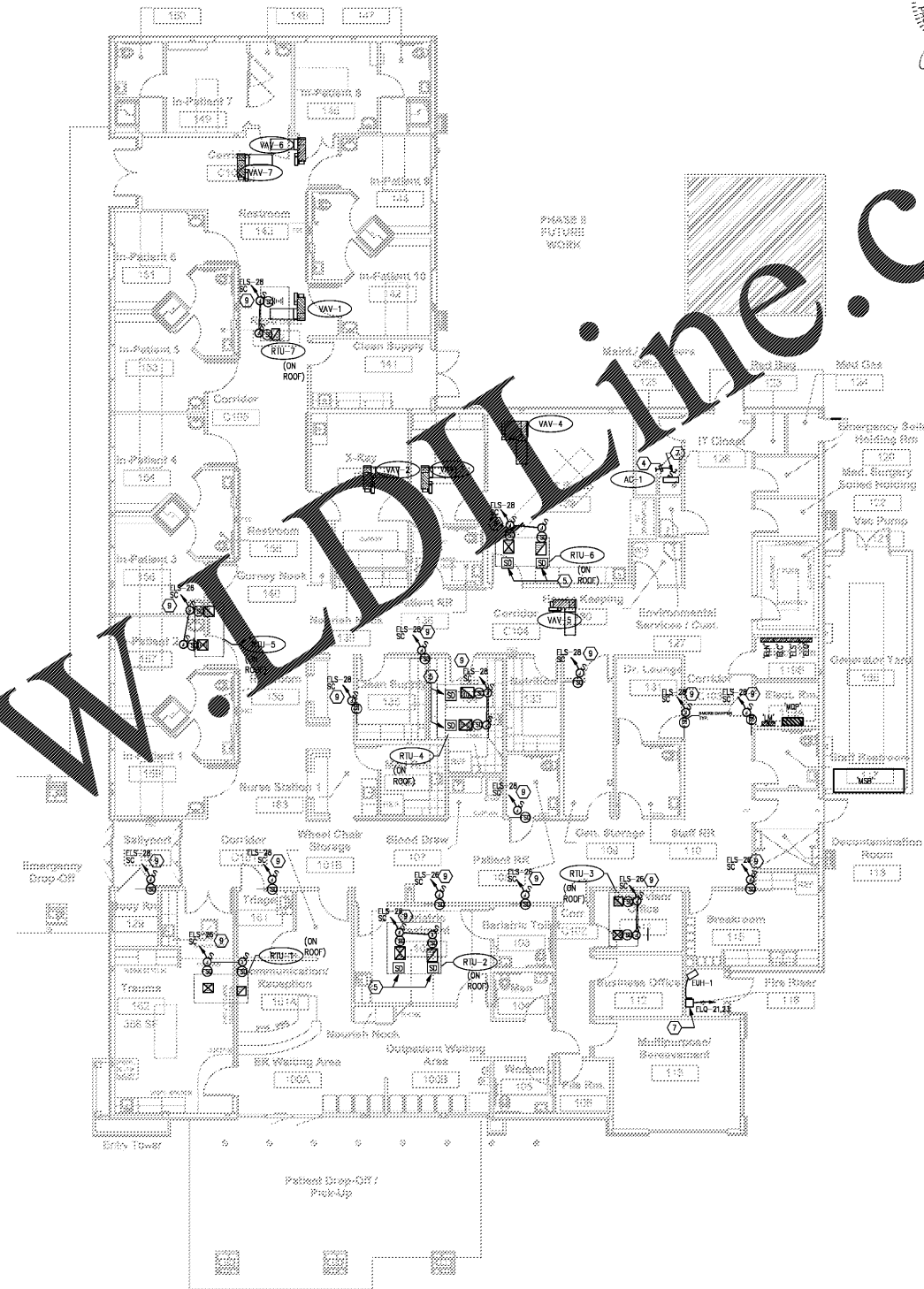
1 ELECTRICAL HVAC PLAN - INTERIOR SCALE: 1/8" = 1'-0"