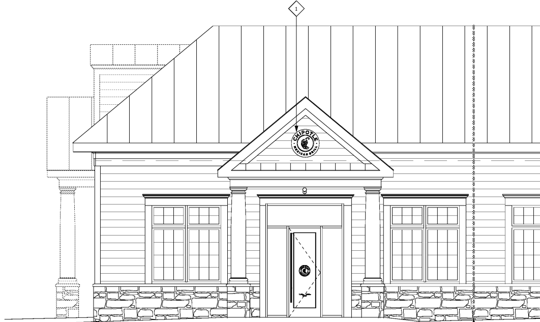
SOUTH ELEVATION 1/4" = 1'-0"