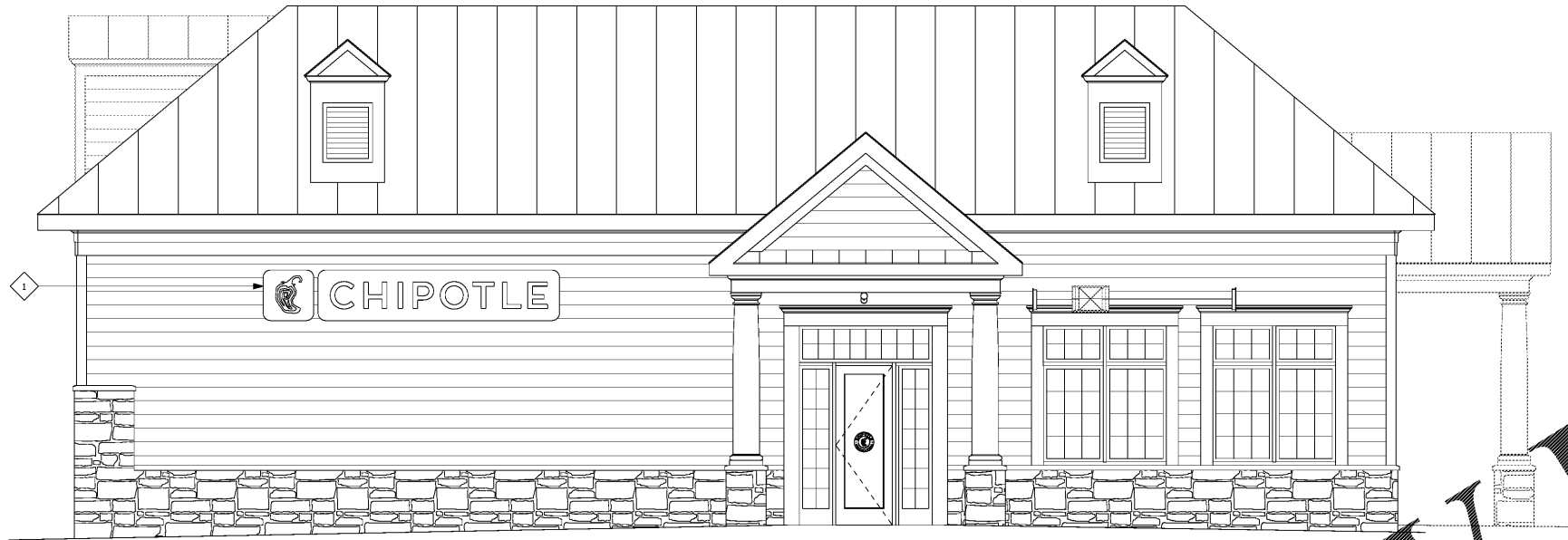
WEST ELEVATION 1/4" = 1'-0"