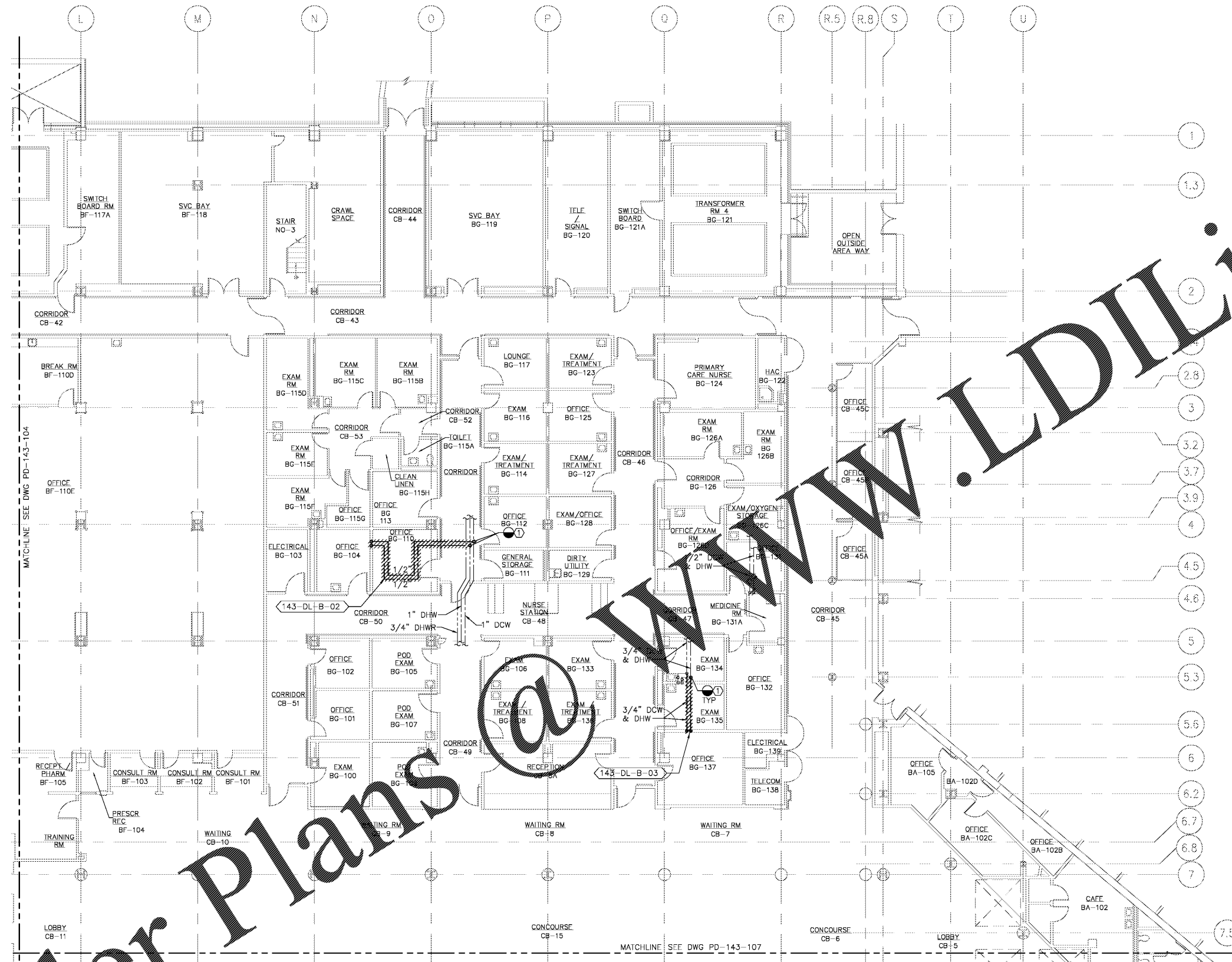
1 BASEMENT PLUMBING DEMOLITION PLAN - AREA 'B' SCALE: 1/8" = 1'-0"