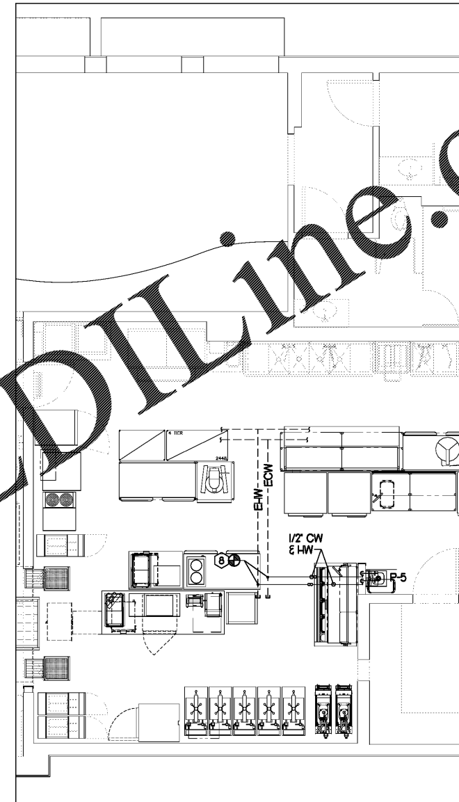
2 ABOVE SLAB PLUMBING PLAN